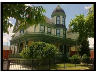
Wayne Street Location